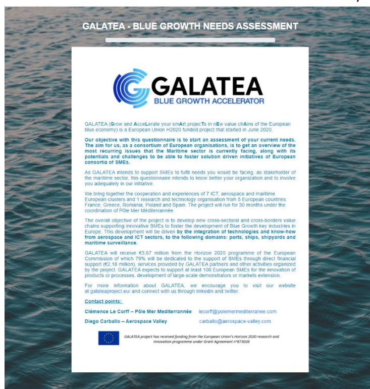
Figure 2 - First page of GALATEA's Drag'n Survey

https://form.dragnsurvey.com/survey/r/d266995d